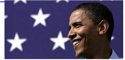
Black Administrators in Child Welfare, Inc.